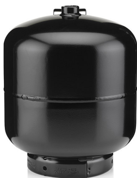
Cylinder - black - for class 2A / 2F refrigerant gas - conforms to Directive 2014/68/EU T-PED - 22 L - small handle - base ring D.205 mm - 25E thread