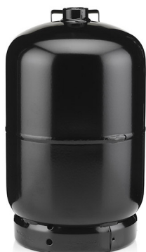
Cylinder - black - for class 2A / 2F refrigerant gas - conforms to Directive 2014/68/EU T-PED - 12 L - small handle - base ring D.205 mm - 25E thread